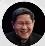
Cardinal Luis Antonio Tagle

'Many parishes in the Archdiocese of Detroit have found Alpha a great tool for helping men and women hear the initial proclamation of the gospel. I am pleased that our use of Alpha with the archdiocesan staff has invited a recommitment to the basic truths of the gospel.'